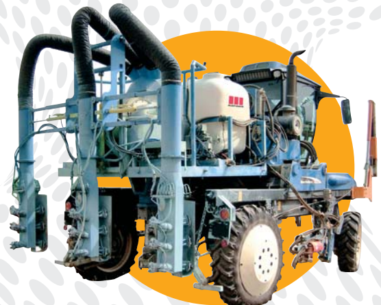
Localized Spraying: 3 Rows